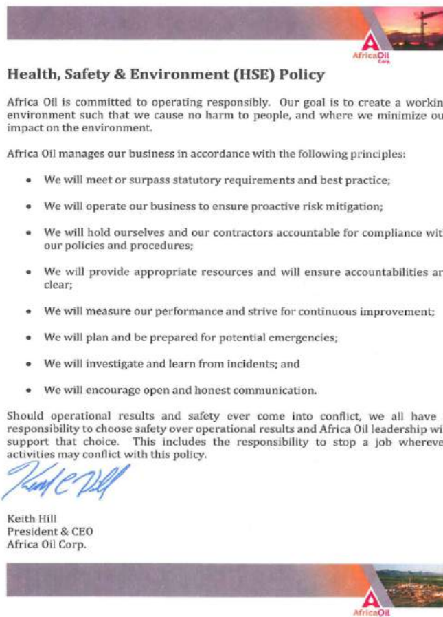
Fig1. HSE Policy

Where conflicts exist between HSE goals, objectives and targets and other business goals, objectives and targets, resolution is consistent with the requirements of these HSE Standards.